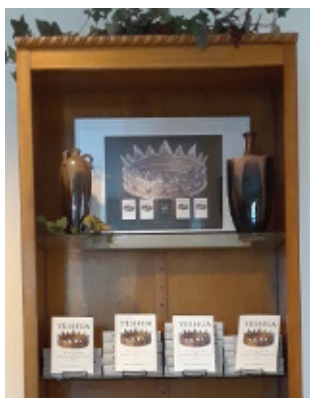
Home Office San Antonio, Texas