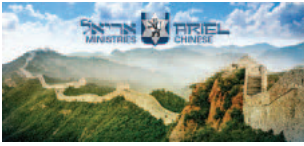
Ariel China Evergreen