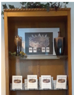
Home Office San Antonio, Texas